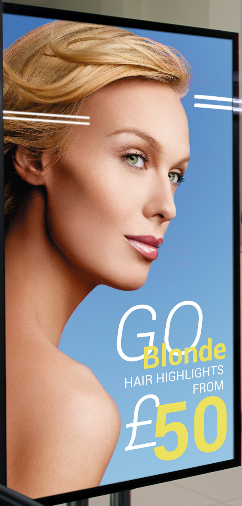
65" High Brightness Monitor